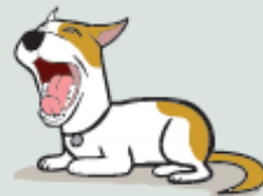
Acting Sleepy or Yawning when they shouldn't be tired