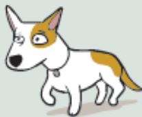
Moving in Slow Motion walking slow on floor