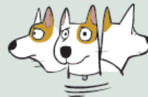
Hypervigilant looking in many directions