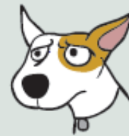
Brows Furrowed, Ears to Side