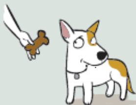
Suddenly Won't Eat but was hungry earlier