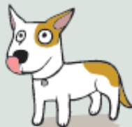
Licking Lips when no food nearby