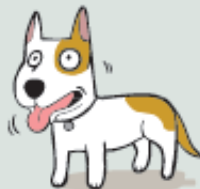
Panting when not hot or thirsty