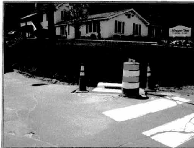
View of Route 219, looking southerly at the Montano-Shea Funeral Home at the corner of Steele Road and Route 219. The current location of the crosswalk ends into a catch basin in a location with no sidewalk, steep topography and a utility pole.