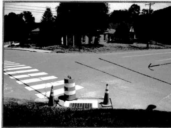
View of Route 219, looking northerly at Central Avenue. The current location of the crosswalk is marked. The new location would be to the right side of the photograph.

Town Hall 530 Main Street Post Office Box 316 New Hartford, CT 06057